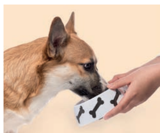
c _____ the dog