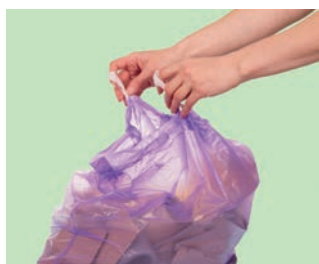
d _____ out the rubbish