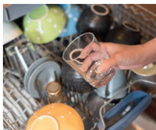
b _____ the dishwasher