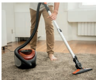
a vacuum the floor