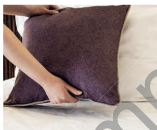
f _____ my bed