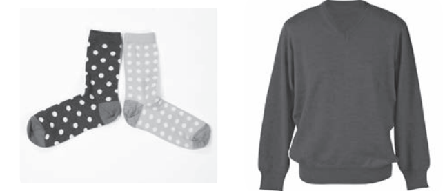
3 _____ 4 _____