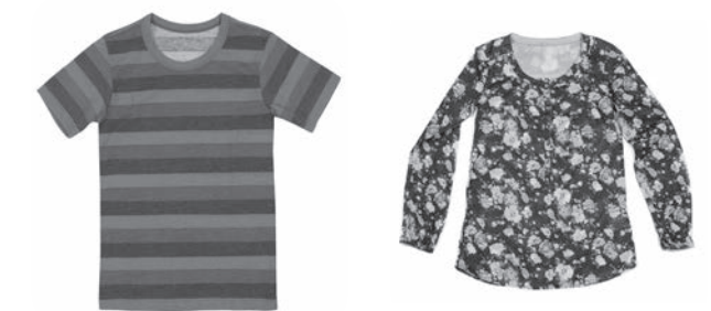
1 striped T-shirt 2 _____