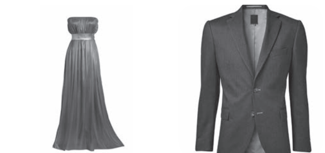
5 _____ 6 _____